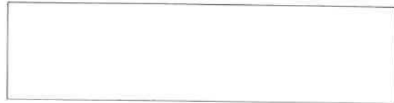
Issuing Official Signature

\$25.25 \times 4 = \$101.00 Provide names of contractors who are doing electrical, HVAC + plumbing. They must be registered with City of Napoleon.